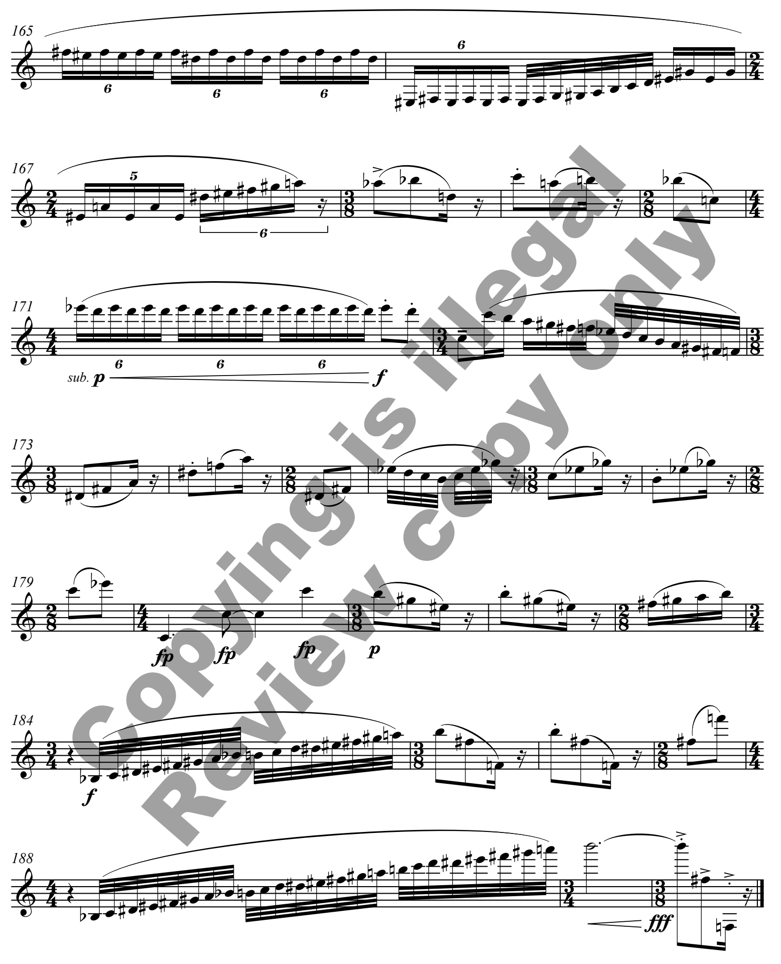
February 19, 2010 Lake Worth, Florida c. 5:20